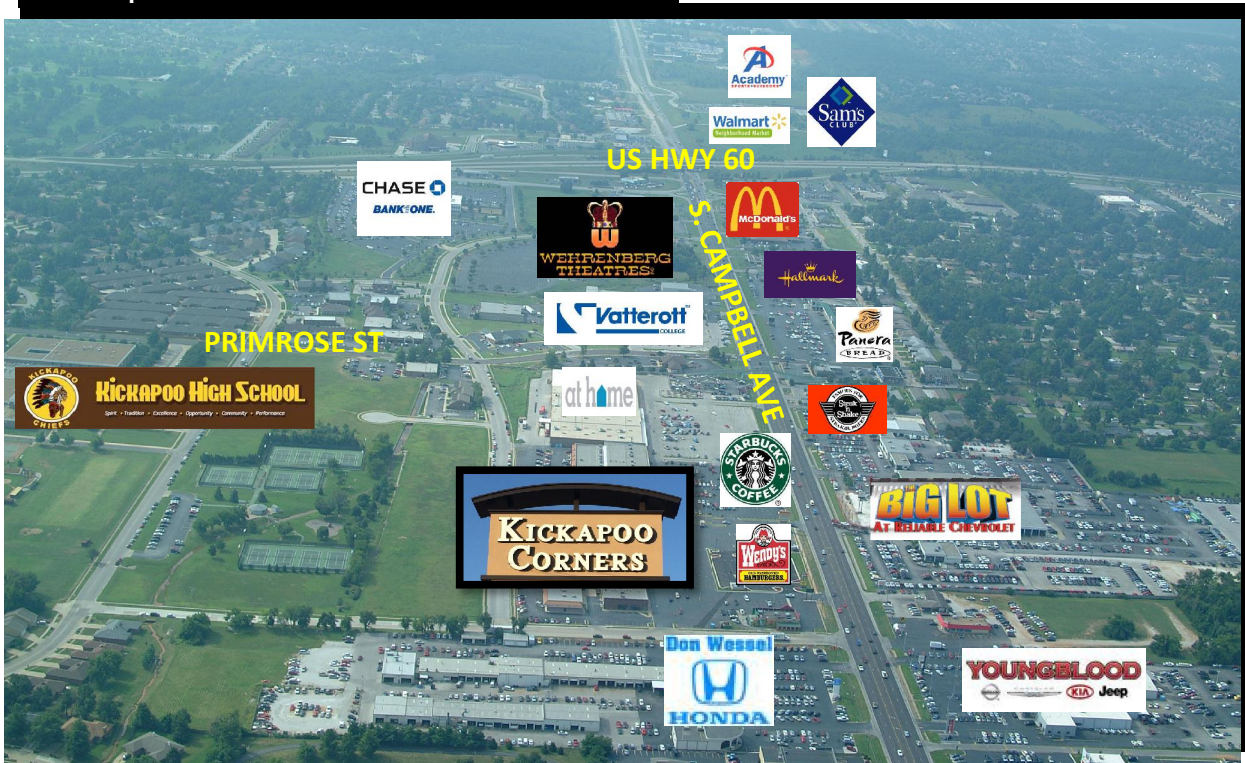
Kickapoo Corners View to the South